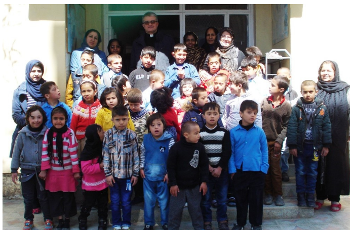
The children with their teachers

For many years in Afghanistan girls were forbidden to study and boys forced to attend Koranic schools. Only after 2001 girls were readmitted to schools, women readmitted to teaching and all subjects were allowed in schools. Therefore we are committed not only to the education and care of children with developmental delays, but also to supporting young women and men through scholarships. Equally important is the collaboration with local authorities, and in particular the University and the Ministry of Education, with whom we have regular contacts and participation in courses and conferences. Finally, we help several families by distributing material, food and medicine.