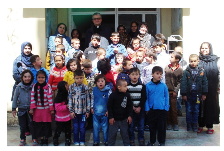
The children with their teachers

On May 22, 2006 the School for children with development delay between 6 and 10 years of age was inaugurated under the direction and leadership of an inter-congregational religious community made up of Sisters belonging to different Congregations that over the years have experienced communion of charisms and shared with the local staff the birth and development of the PBK School.